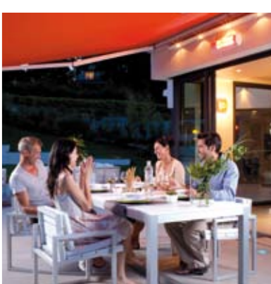
p. 4 Benefit from the ease of remote control and operate your awning without moving from your deck chair. Farewell to cumbersome crank handles.